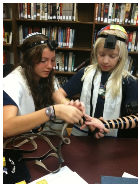
Sunday School: Tefillin Wrap

Community Shabbat Dates: Next Community Shabbat Date is March 24th